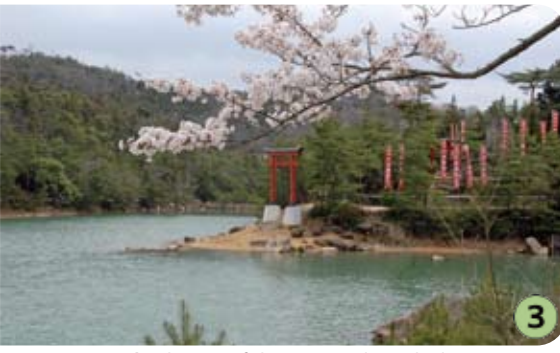
Ryuo Lake. home of the rain god. HachidaiRyuo Featival takes place in the spring.