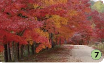
Japanese Maple Hill in Spring and Autumn.